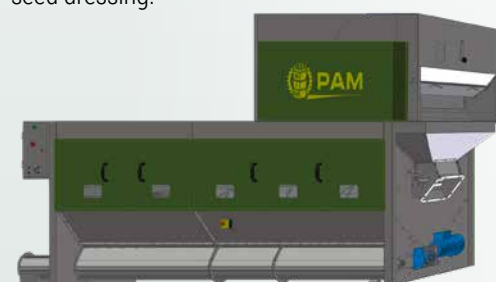
Multifunctional grain cleaners OBC-355

To achieve high quality grain cleaning, an OBC-354 or OBC-355 rotary-type grain cleaning machine is also used, equipped with a powerful aspiration system and then a rotating cylinder containing from 3 to 5 successively located sieves. You can reject the flow passing through any sieve in the desired direction. This is necessary to configure the desired operating mode and grain processing. Depending on the needs, the operator will be able to change the pattern of use: simple quick cleaning, calibration, high-precision calibration, separation of the seed of several crops between themselves and from impurities, seed dressing.