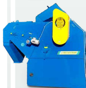
Pre-cleaning machine PCM-80