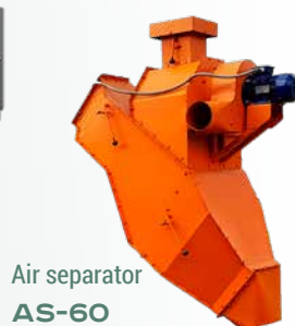
Air separator AS-60